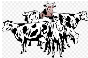
A ...herd... of cows