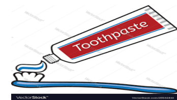
A ..... of toothpaste