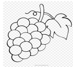
A ..... of grapes