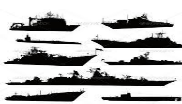
A ..... of ships