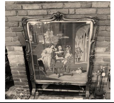
A fire screen tapestry kept in front of a fireplace.

tapestry : a picture with a frame and stand that is used to cover the fireplace when it is not in use or cloth with pictures or designs woven in it, used to hang on walls as a decoration or as a covering for furniture