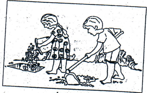
clean, sister *