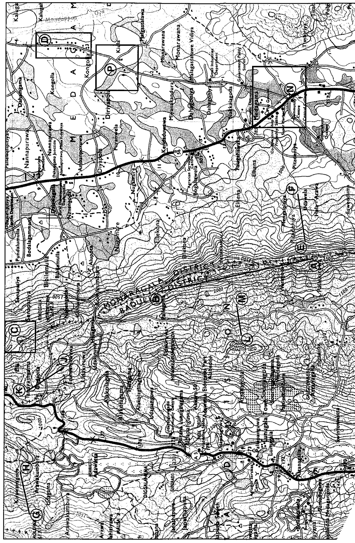
SCALE 1 : 50,000