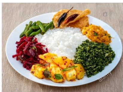
Rice and Curry