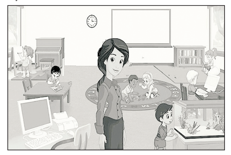
Test-04 Fill in the blanks with suitable words given within brackets. The first one is done for you. (05 marks)