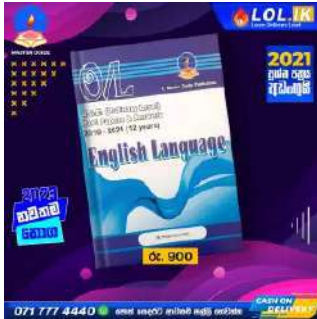
O/L English language Past Paper Book – Master Guide