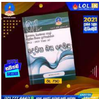
O/L Second Language Tamil Past Paper Book – Master Guide