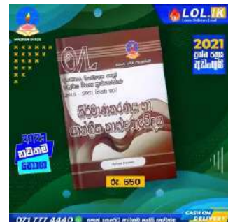
O/L Design And Mechanical Technology Past Paper Book – Master Guide