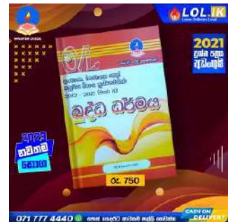
O/L Buddhism Past Paper Book – Master Guide