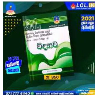
O/L Science Past Paper Book – Master Guide