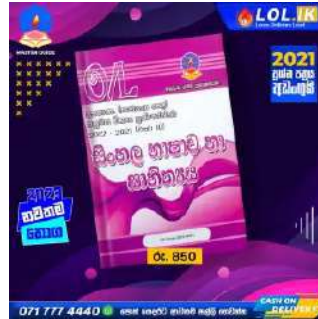
O/L Sinhala Language Past Paper Book – Master Guide