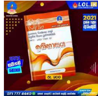
O/L History Past Paper Book – Master Guide