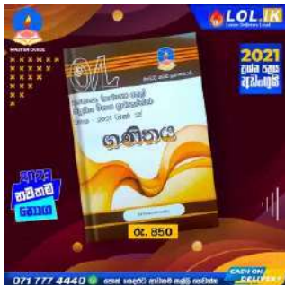
O/L Mathematics Past Paper Book – Master Guide