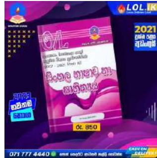
O/L Sinhala Language Past Paper Book – Master Guide