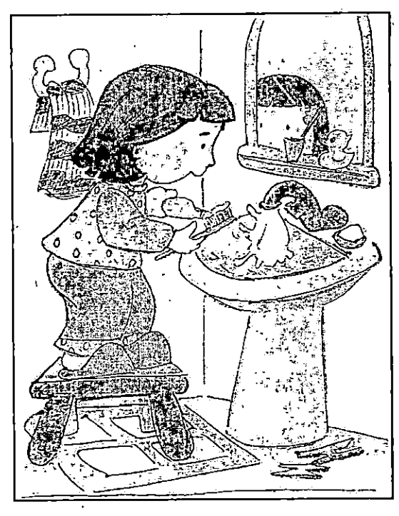
Test 3 Study the picture and fill in the blanks in the text given below.