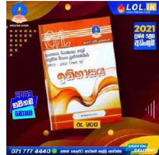
O/L History Past Paper Book – Master Guide