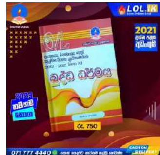
O/L Buddhism Past Paper Book – Master Guide